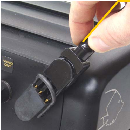
6 pin connector